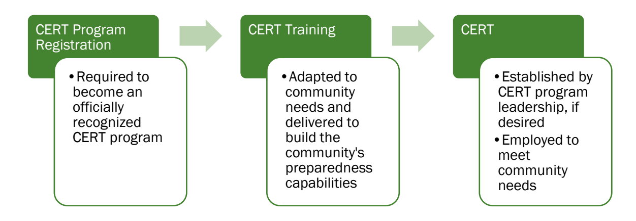
Figure 1: CERT Program Process Overview

Each CERT Program contains a training component and, if desired, teams for actual response and other activities. At its most basic level, the purpose of the CERT Program is to train and organize community members so they may prepare for and respond to emergencies. The CERT Program offers training to individuals so they may learn skills to meet the needs of their community in the case of an emergency. CERTs can teach community members about preparedness and assist with mitigating potential hazards in their community. CERTs can also augment emergency management and response capabilities by assisting first responders during and after an emergency.