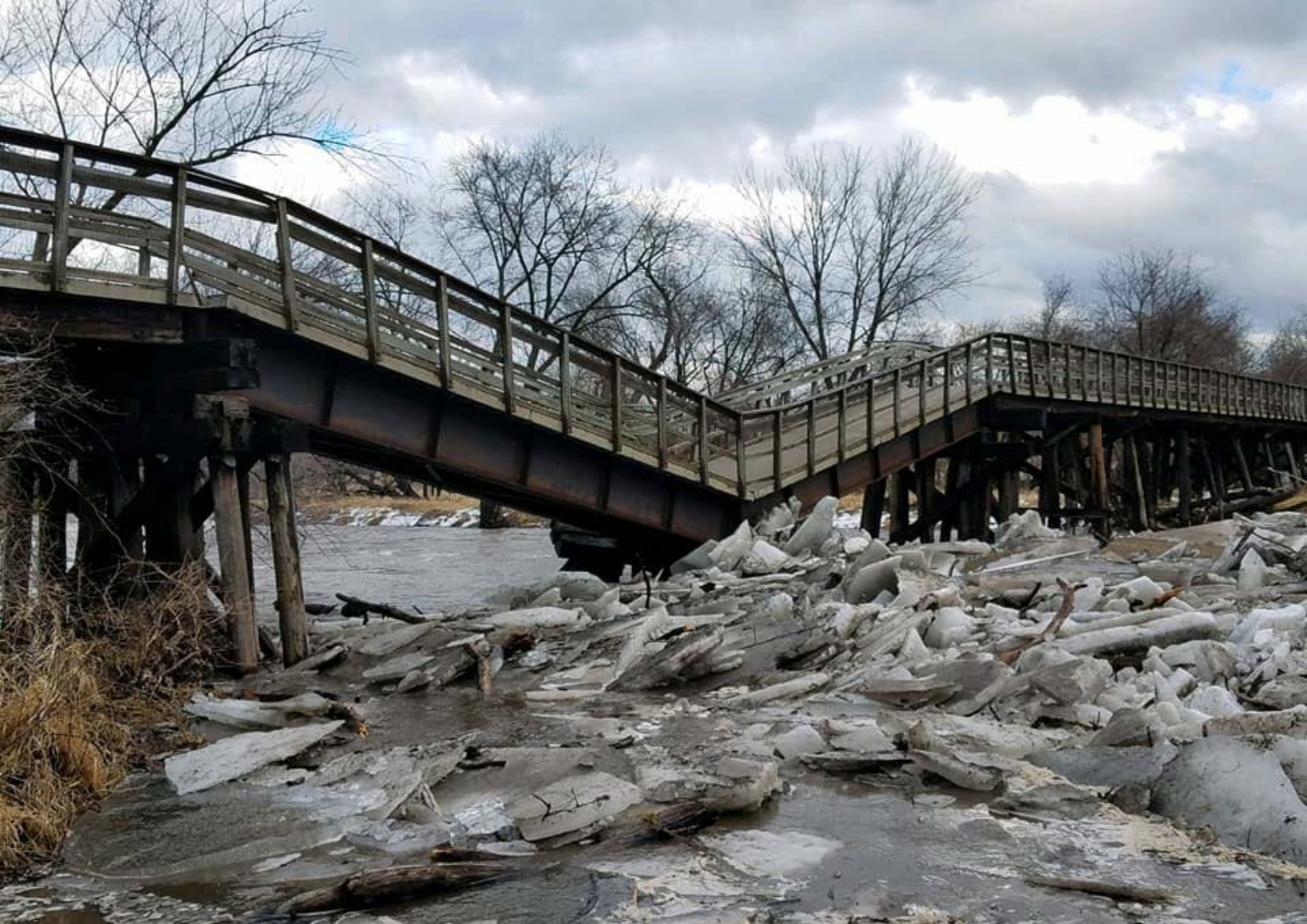
Johnston Trestle Bridge March 2019