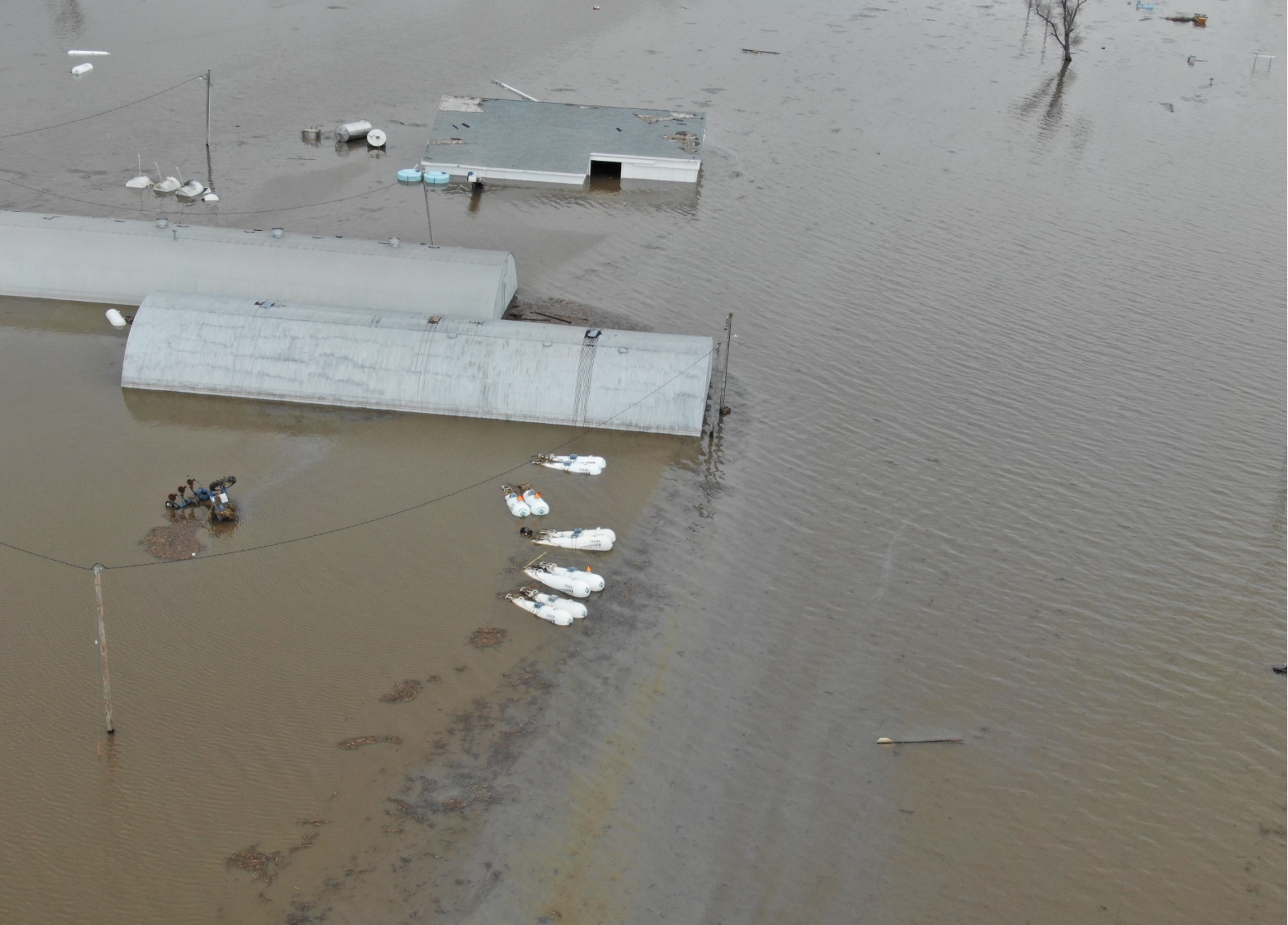
Pacific Junction March 2019