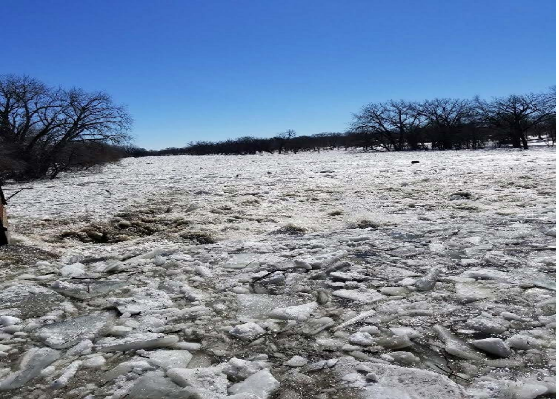
Green, Iowa March 2019