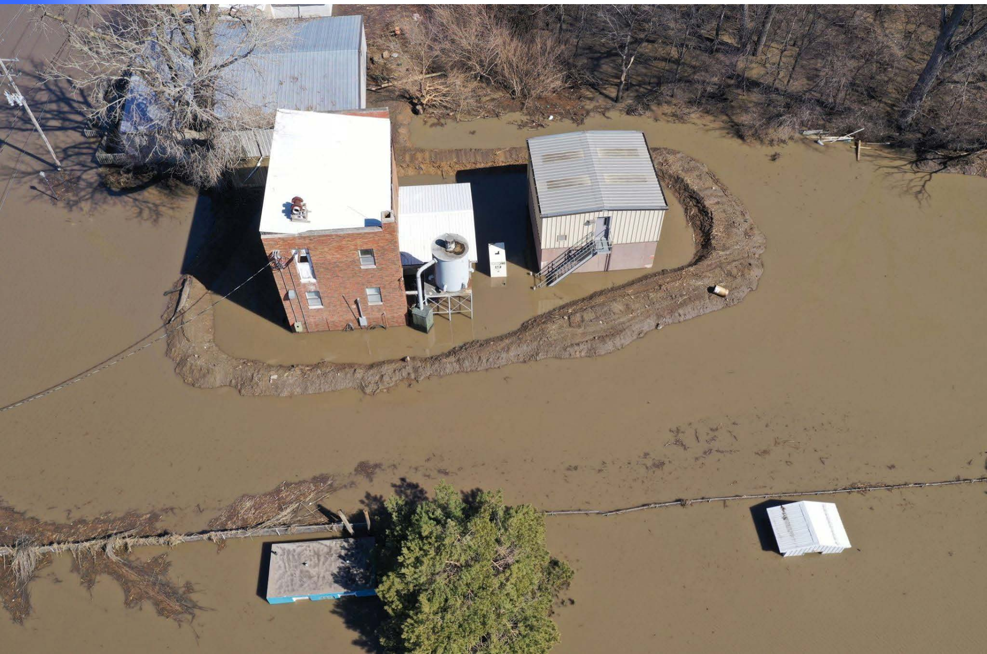
Hamburg Water Works 2019