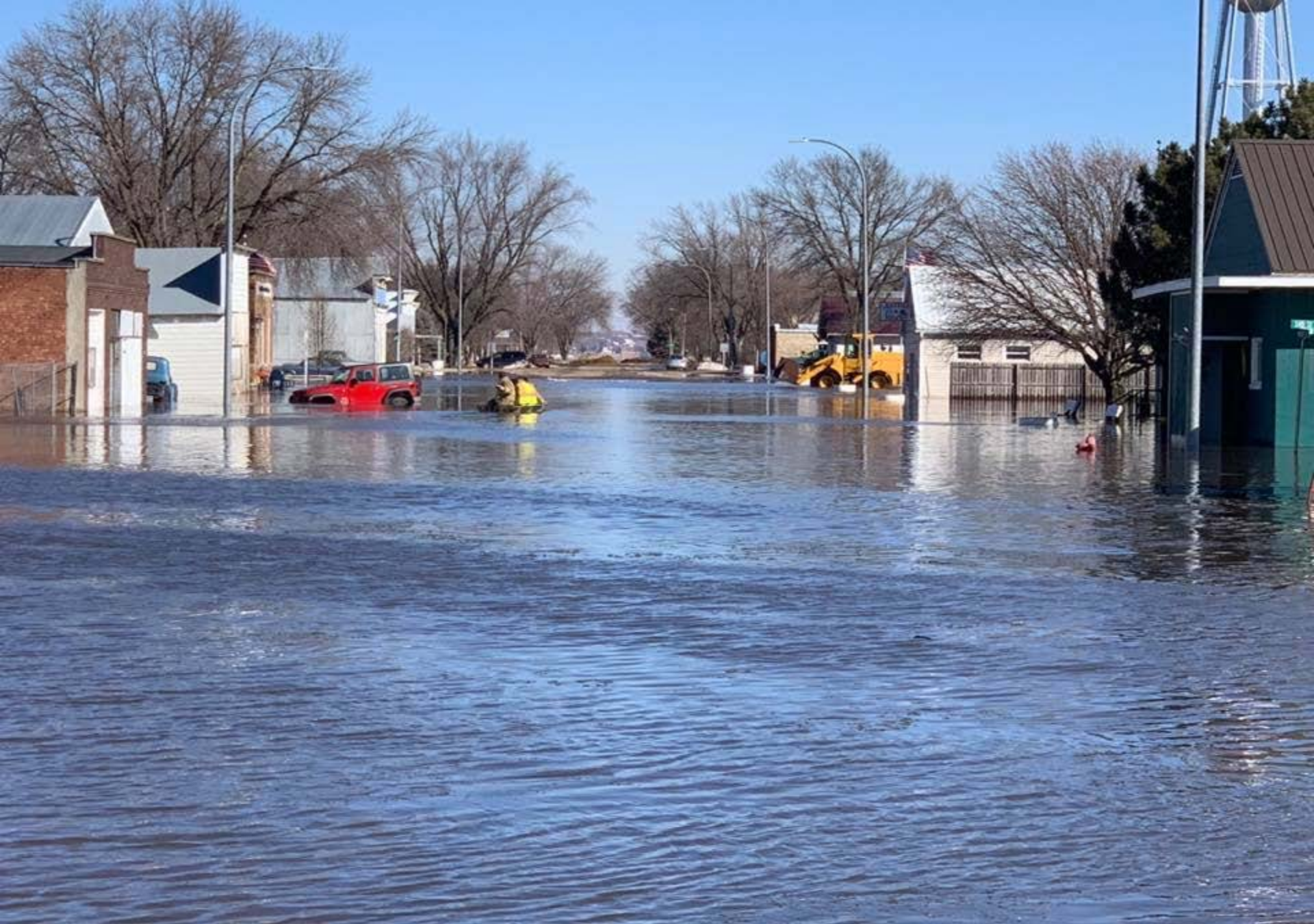
Hornick March 2019