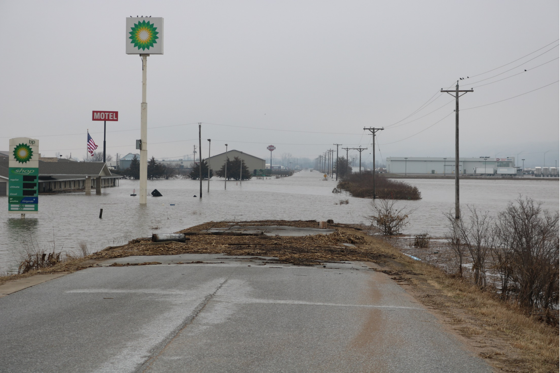
Pacific Junction March 2019