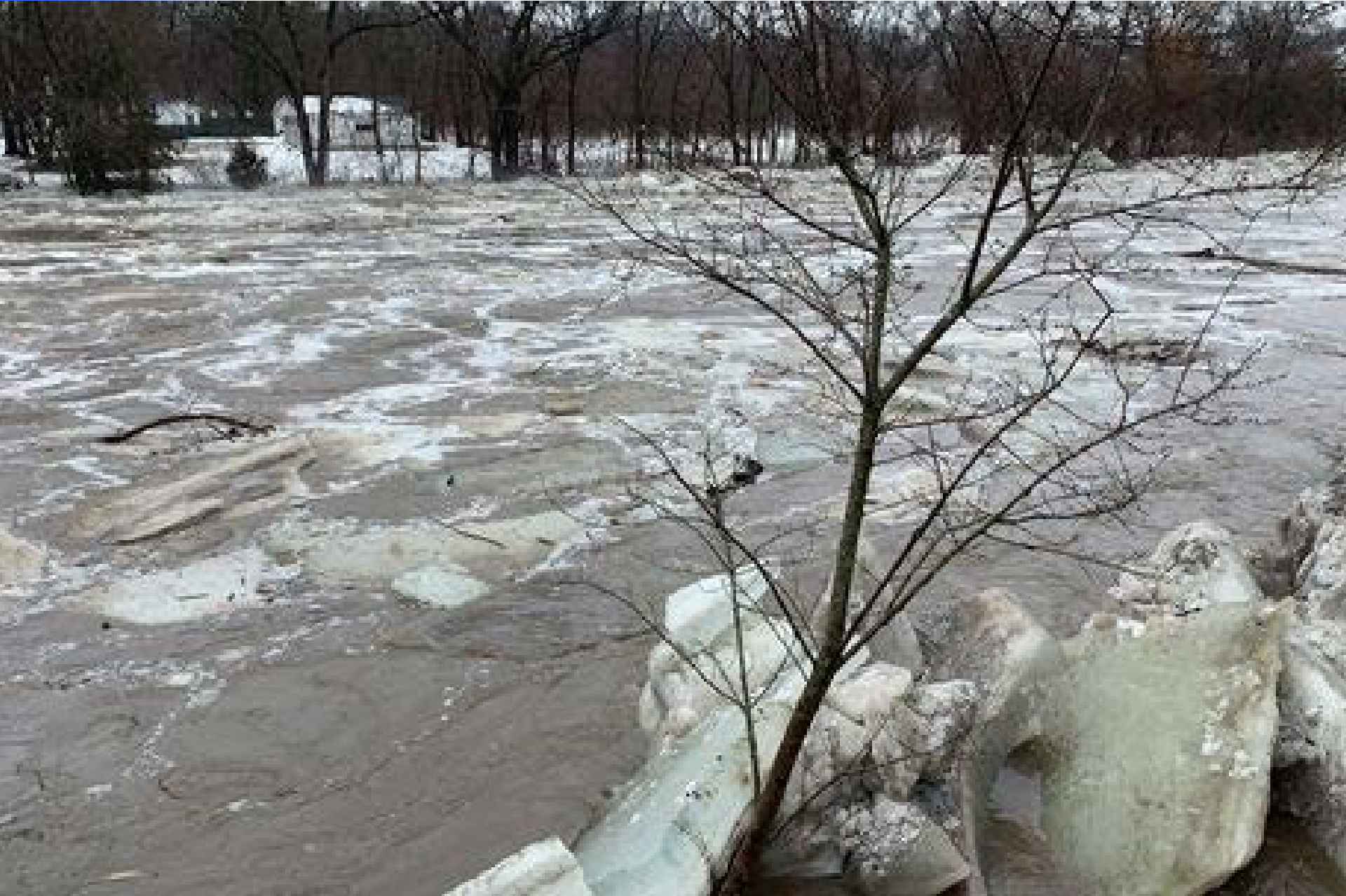
Dallas County March 2019