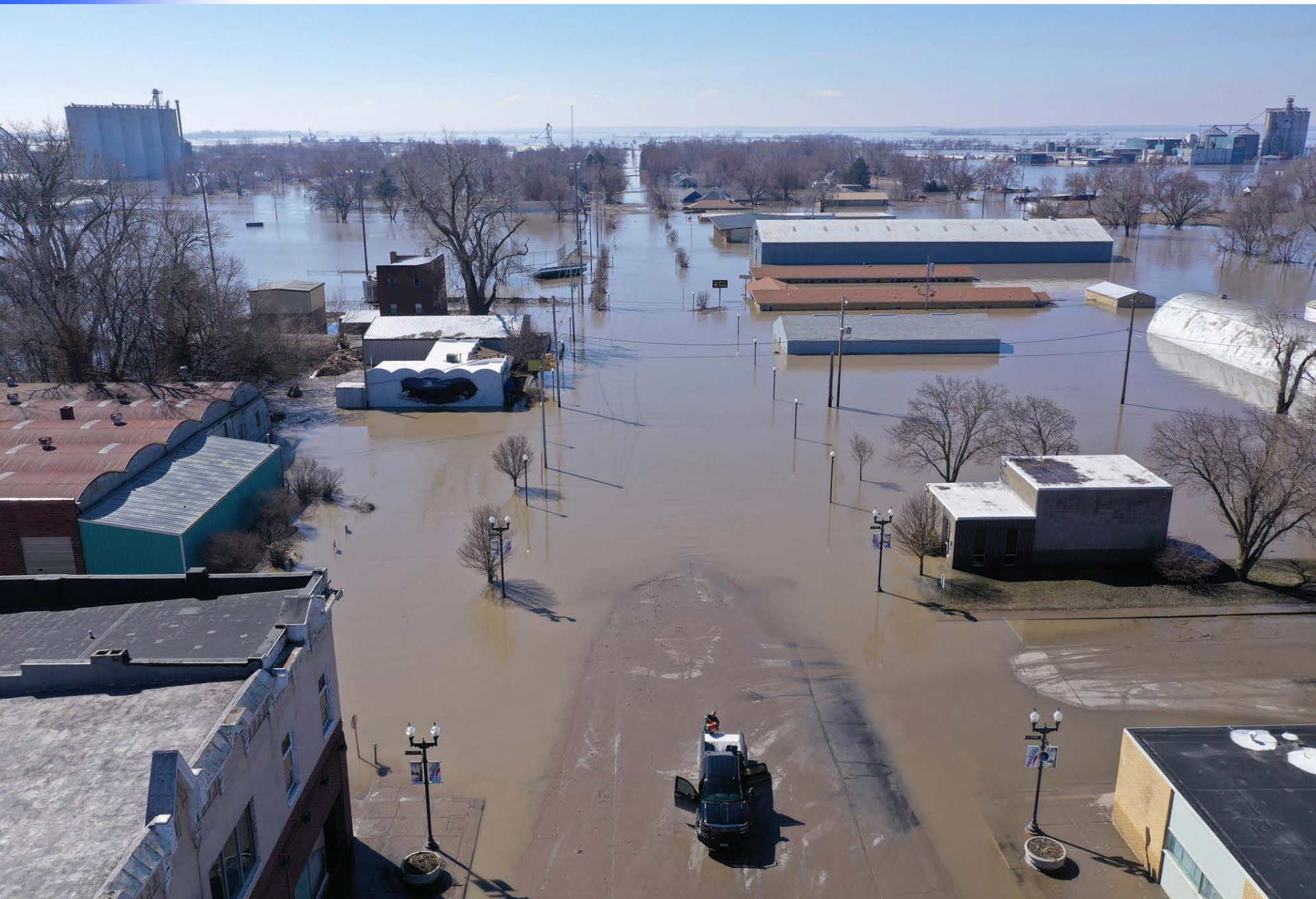
Hamburg March 2019